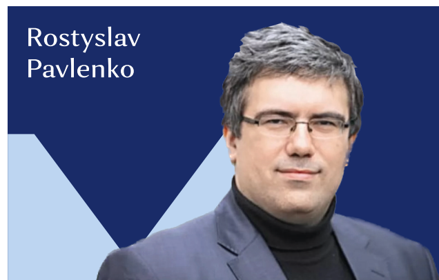
Politician and Member of Parliament, honoured with the Order of Freedom for his efforts in securing the Tomos of Autocephaly for the United Orthodox Church of Ukraine