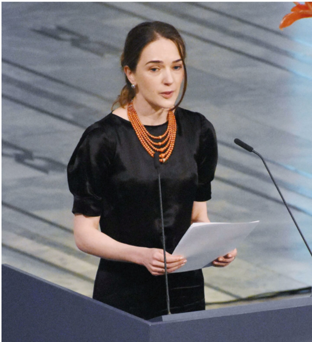
Oleksandra Matviichuk, kmbs student, Head of the Centre for Civil Liberties, a Nobel Peace Prize winner in 2022

was founded at National University of Kyiv-Mohyla Academy in 1999. Kmbs is a platform that brings together key social players from business, government, education, and civil society (the Quadruple Helix approach). It creates an intellectual environment based on the open system principles, where students learn from their instructors, guest speakers, and their peers. This environment aims to change the students' thinking, develop the ability to ask the right questions, putting the search for meaning in the first place.