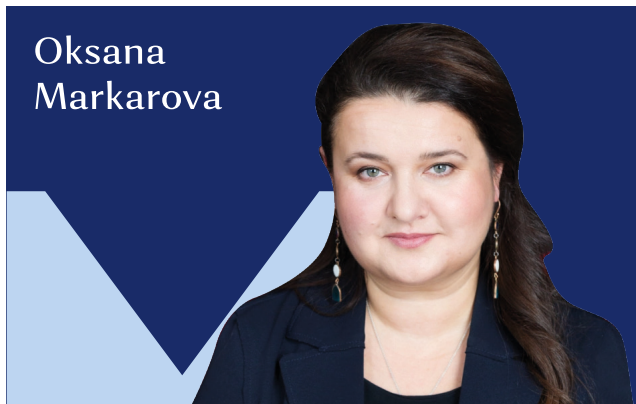
Ukraine's Ambassador to the USA