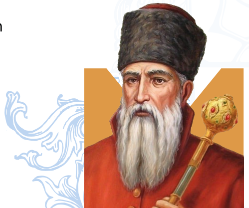
Hetman Petro Sahaidachnyi is one of the Academy's patrons and is buried on its grounds.