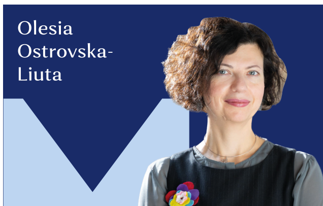
Director of «Mystetskyi Arsenal», Ukraine's flagship cultural institution that brings together various arts